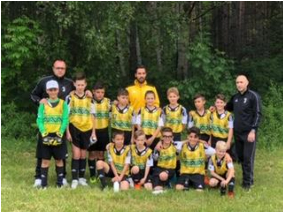
Juventus World Cup Team (Turin) 2018

Note: The above dates are subject to change and will be communicated via the Team App.